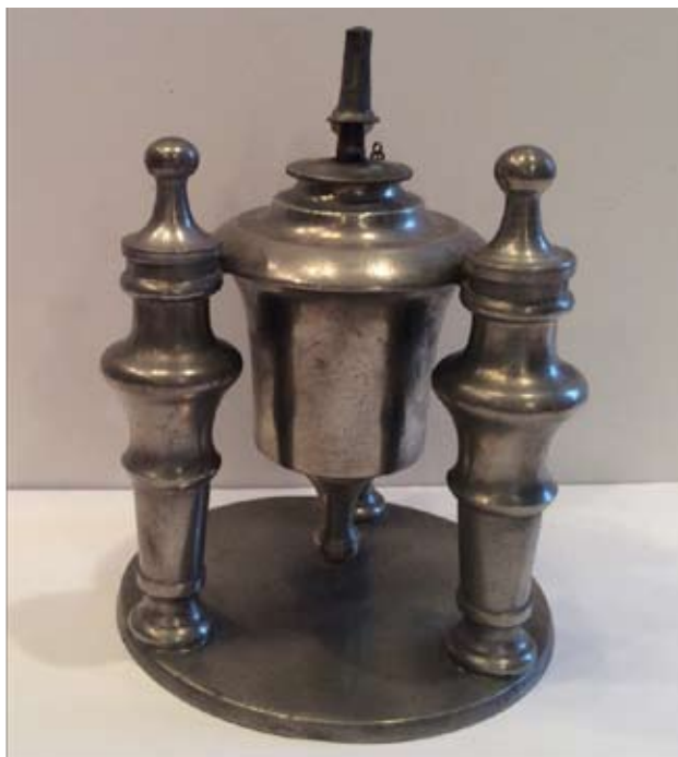
Figure 3 A Roswell Gleason marked Cigar Lighter.