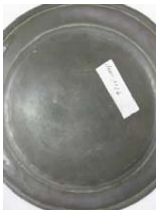
Marked to the back as