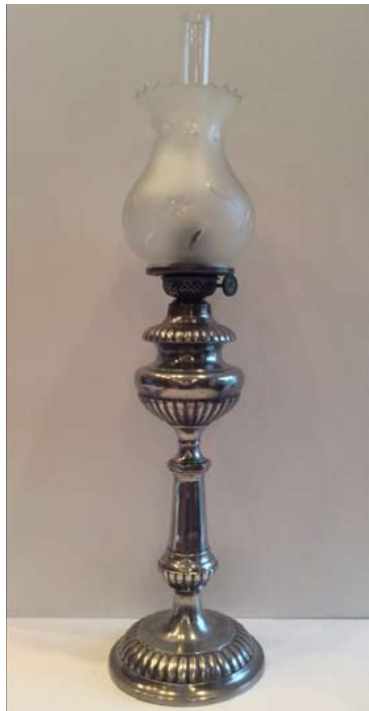
Figure 4 An unmarked Yale & Curtis Cardan lamp.