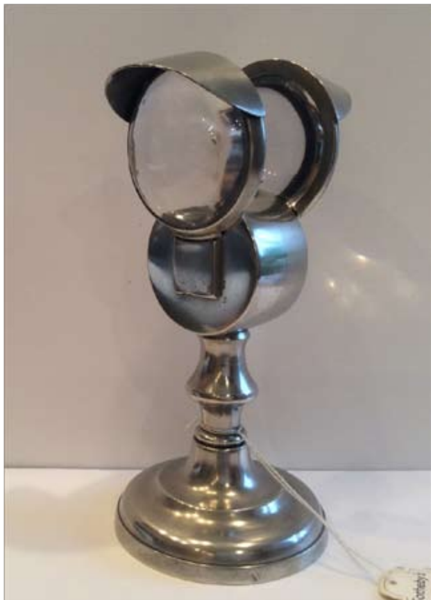
Figure 1 A Roswell Gleason marked Doule Bulls-Eye lamp.