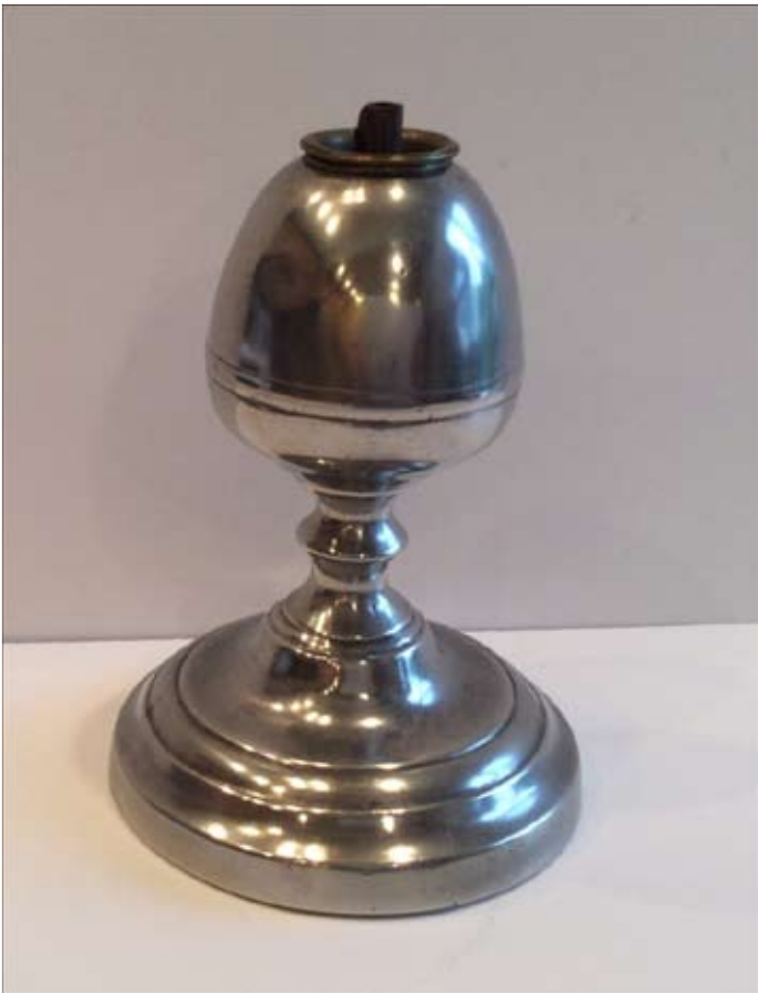
Figure 7 An unmarked Meriden Britannia lamp.