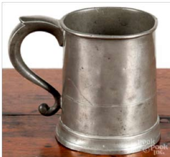
A pewter mug with the touch of Thomas and Sherman

A Hartford, Connecticut pewter mug, ca. 1840, bearing the touch of Thomas and Sherman Boardman, 4 1/4" high.