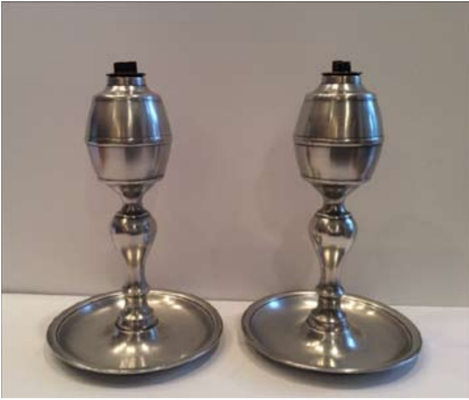
Figure 5 A pair of Boardman & Co. lamps with eagle mark.