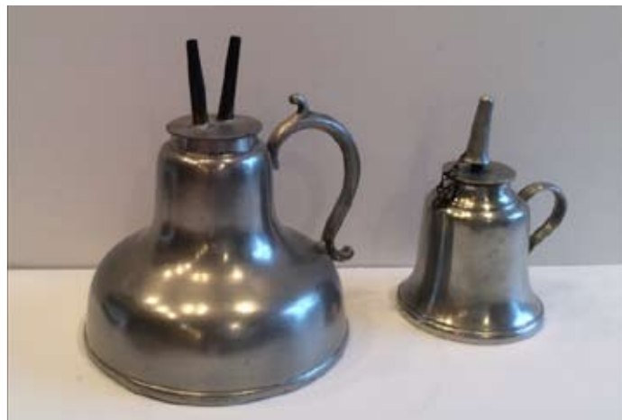
Figure 2 Two marked Marston Baltimore lamps.