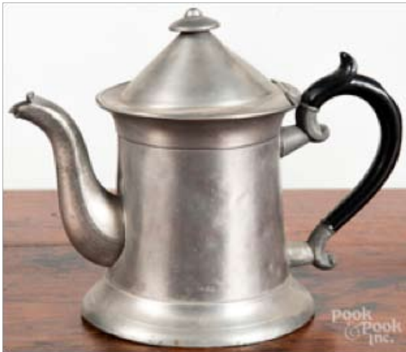
A pewter teapot with the touch of Rufus Dunham: Image courtesy of Pook & Pook, Inc.

A Westbrook, Maine pewter teapot, mid 19th century, bearing the touch of Rufus Dunham, 6" high.