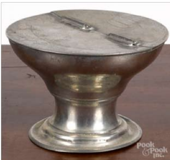
A pewter teapot by George Richardson; Image courtesy of Pook & Pook, Inc.

2017 March Sale Offering: A Cranston Rhode Island pewter sugar bowl, 19th century, bearing the touch of George Richardson, 4 1/2" high.