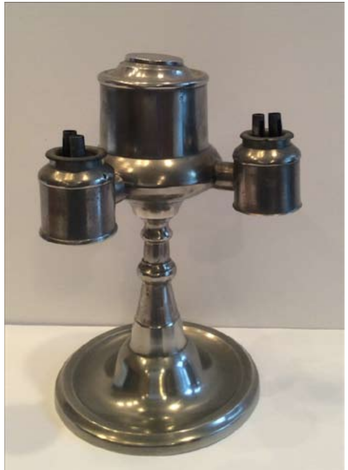
Figure 6 A marked Ephraim Capen lamp.